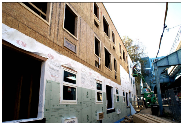
Progress of Rights of Passage Building Construction, taken November 3.

primarily been on waterproofing the building and installing the windows. The hope is to have the entire facility closed in before the temperature gets too cold. If you pass by the building right now, you will see that the entire building is wrapped in Tyvek and other waterproofing materials, and all