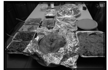
This year's Covenant House Christmas Party will be held on December 22, 2009, and we anticipate over 100 youth and children will be in attendance.